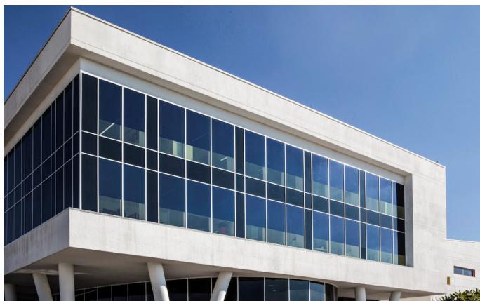
Swiss International Scientific School Dubai, UAE, with zoned SageGlass coating.

Traditionally, mechanical shades are used to prevent excessive solar heat gain and glare in buildings. Smart or dynamic glass can automatically reduce light transmittance from fully transparent to near-fully dark. This enables a higher level of control, while maintaining outside views and visual appeal of a high-glass façade. Saint-Gobain subsidiary SageGlass , and competitors such as View Inc. , iGlass Technology , ChromoGenics , and Kinestral , all offer smart glass solutions.